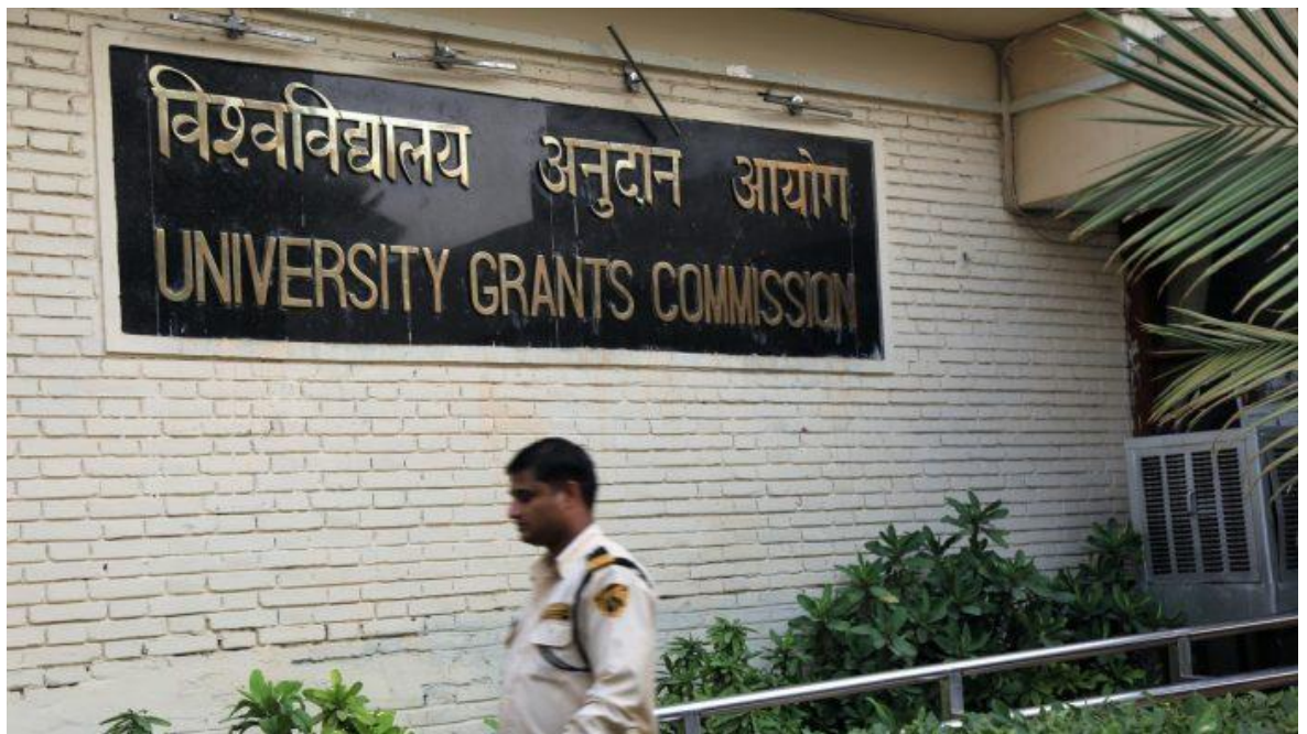
UGC building in New Delhi

New Delhi: The University Grants Commission (UGC) has sought to justify its decision of making final-year exams mandatory for college and university students by citing top-ranking global institutes such as MIT and Cambridge University which conducted exams during the Covid pandemic.